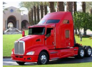
New T660 Model with Aerodynamic Styling, Enhanced Fuel Economy

The T660's unsurpassed aerodynamics makes it a perfect truck for line haul applications. With the superior maneuverability provided by its set-back front axle, the T660 is the perfect truck for pickup and delivery and regional haul applications. Or select from the wide range of weight-saving options, and the T660 is the ideal truck for bulk haulers or anyone trying to maximize payload.