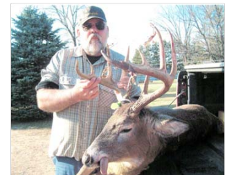
Might this be one of Santa's reindeer?