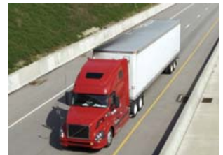
The trucking industry is the driving force behind the U.S. economy.

A focus on core needs is also reflected in the retail sector, where the popularity of luxury items is waning. People still need to eat; they're just buying simpler foods.